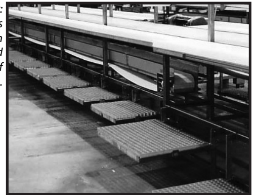
Photo on Right: FGI-AM® grating was utilized for work station platforms that could adjust to the height of the line workers.