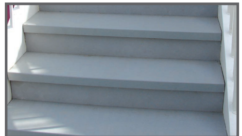
Covered stair treads, with hidden hold down clips, lead to a water slide at a municipal waterpark in Oklahoma.