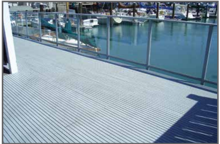
Corinthian Yacht Club Harbor in San Francisco, California.

Aqua Grate is available in a variety of lengths and widths, making it useful for a number of waterfront and recreational applications. The fine grit surface of Aqua Grate provides a high level of slip resistance, yet at the same time offers a comfortable barefoot walking surface. Protection against long-term UV exposure is provided by a synthetic surfacing veil and UV inhibitors in the resin formulation. Whether subjected to chlorinated water in public and private pools or salt water environments found in marine and waterfront applications, Aqua Grate will offer years of low cost, low maintenance service.