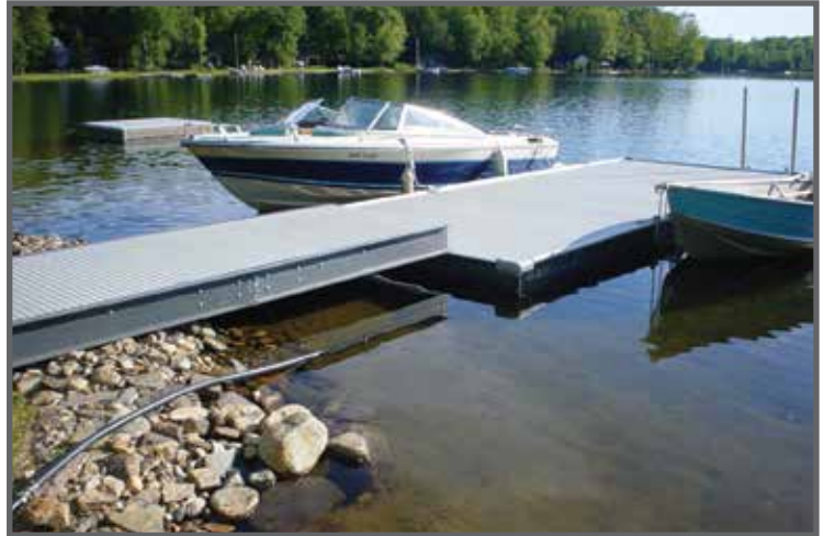
Boat dock on Horseshoe Lake in Haliburton, Ontario.

Aqua Grate T1210 and T1215 pultruded pedestrian grating is specifically engineered to withstand the corrosive conditions associated with recreational and general marine applications and to meet ADA guidelines. With its nominal 1/4" space between the 1-1/2" wide bearing bars, Aqua Grate offers optimum comfort and safety for bathers walking with bare feet — a must in high traffic, public recreational areas. Aqua Grate grating has a unique combination of corrosion resistance and light weight which provides easy, inexpensive installations in such facilities as swimming pools, water parks, marinas and piers.